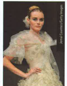
Jemal, Courtesy Getty Images