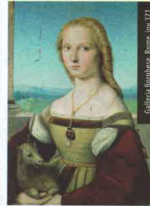
Galleria Borghese, Rome, inv. 371